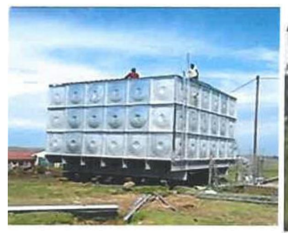
Qunu galvanized steel tanks