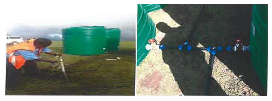
Jojo tanks for Qunu PMVA's