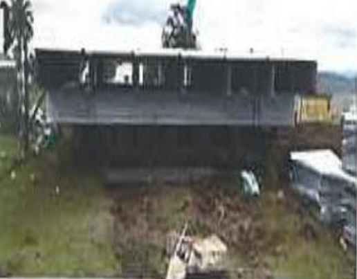
Qunu galvanized steel tanks