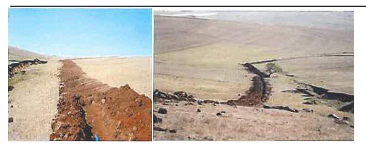
Qunu new Borehole rising main