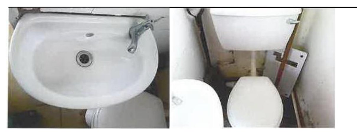
Repairs to Mthatha Airport & Qunu Community Centre