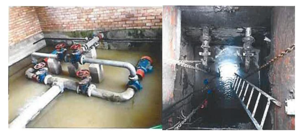
Mthatha sewer pump station

Mthatha sewer pump station refurbishment Mthatha sewer pump station refurbishment